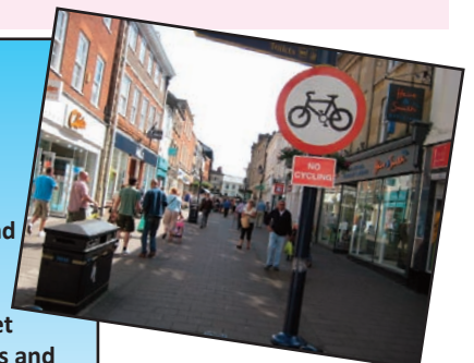
Photo: The Brittox, Devizes